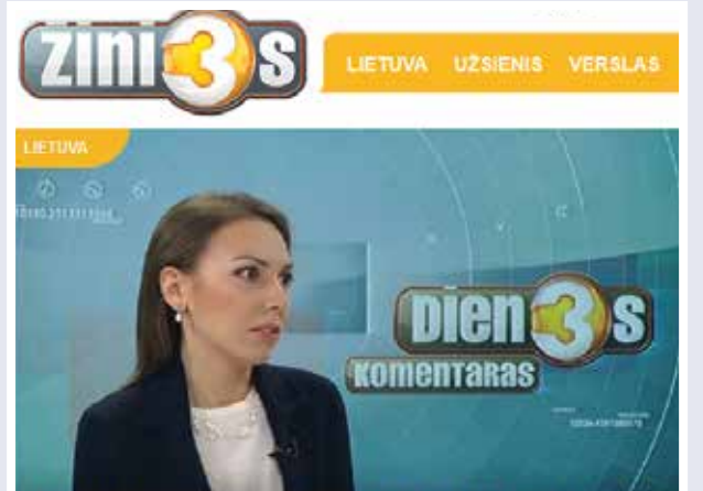
Nekilnojamojo turto mokestis: ekspertai abejoja vyriausybės planais

24/7: perki alkoholj - paremi pensininką? (I)